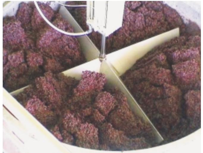
The patented mechanical plunger.