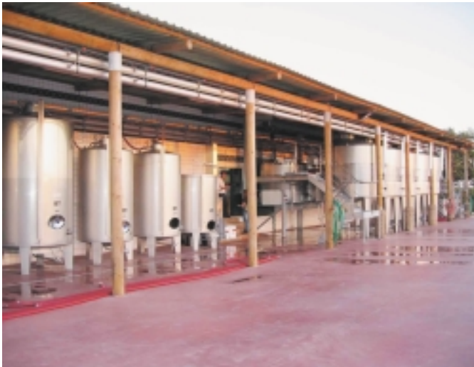
Tanks in the storage area.